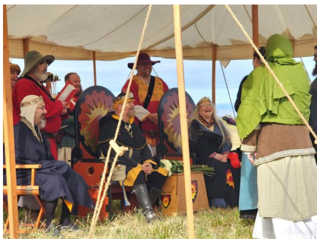
Vulcanalia 2022 Court.