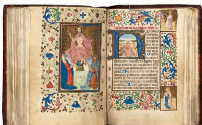
A Dutch book of hours, ca. 1470, with illuminated miniatures attributed to the Masters of the Zwolle Bible. Boston Public Library.