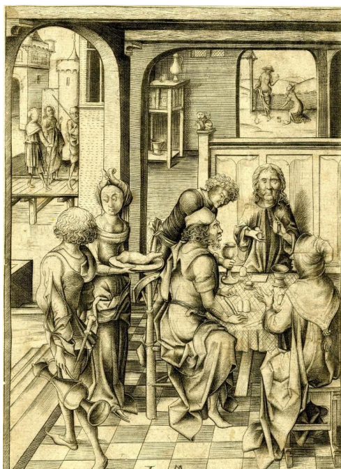
The Supper at Emmaus. Print by Israhel van Meckenem. c. 1480. Engraving. British Museum.