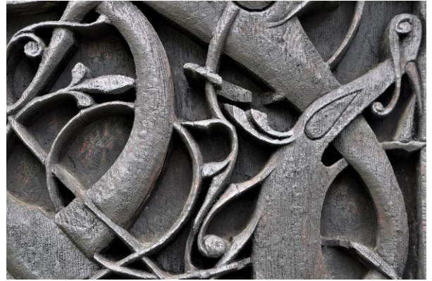
Nídhögg eating the roots of Yggdrasil, from a carving at the stave church at Urnes, Norway.

*For more details, visit antir.org/events/ .