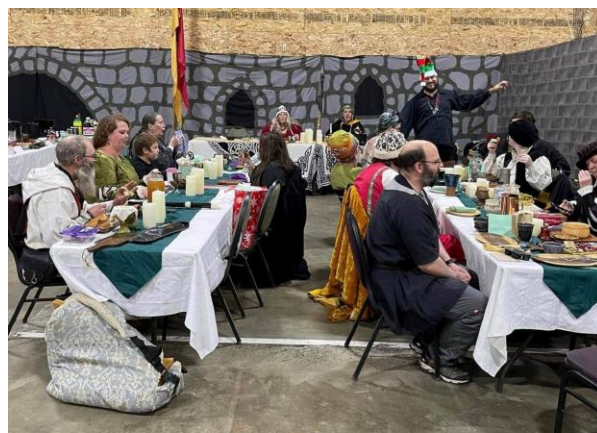
Yule 2022.