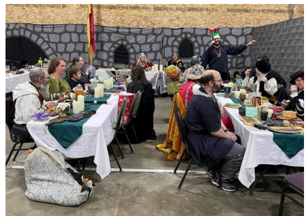
Yule 2022.