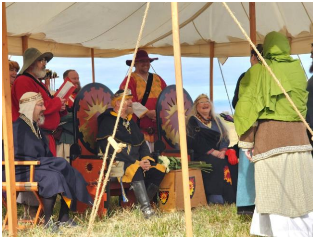
Vulcanalia 2022 Court.