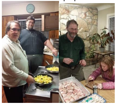
Then the day of the feast...